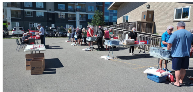
picture of our meal packing event from 2021

On Sunday October 15th, we’re hosting a meal packing event with Lifeline Christian Ministries. Our goal is to pack 4,000 meals that will be sent to some of the most vulnerable people around the world. It’s an exciting, interactive and fun experience for us. It’s one way we’re throwing out the seeds of the kingdom.