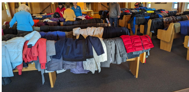
picture of winter jackets being set out for our annual Christmas shopping day

"To be most effective in bringing about change in a community or a neighborhood, it helps if you live there."