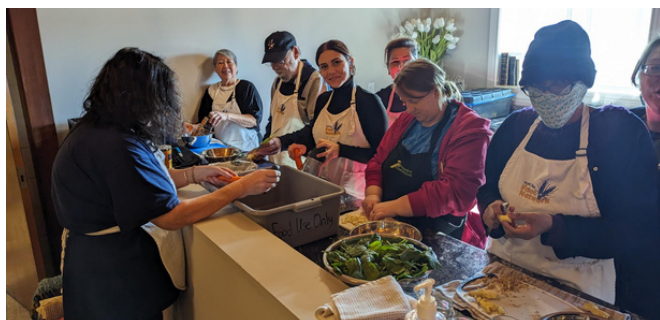
picture of food prep class held at the church twice each month

In recognizing the variety of ways God is at work in our midst, I suspect that we'll be able to do what Paul is asking us to do in the letter to the Thessalonians: be joyful and to give thanks.